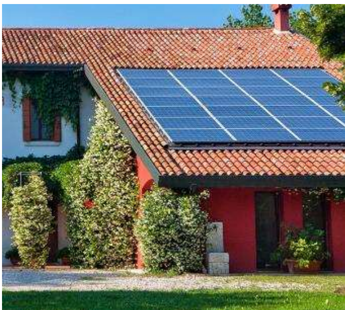
HOME / INDUSTRY