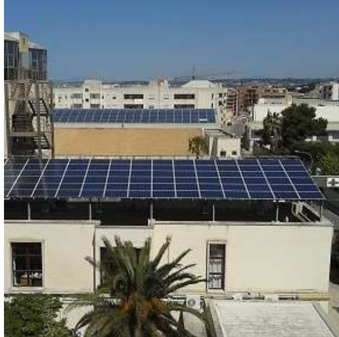
ON-GRID / OFF-GRID